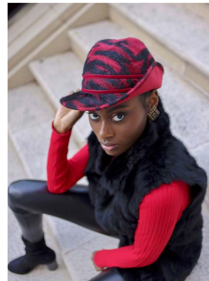
The Aroscia headpiece is a short brimmed Trilby made from a silky red and black animal print velour felt and decorated with a red velvet band.