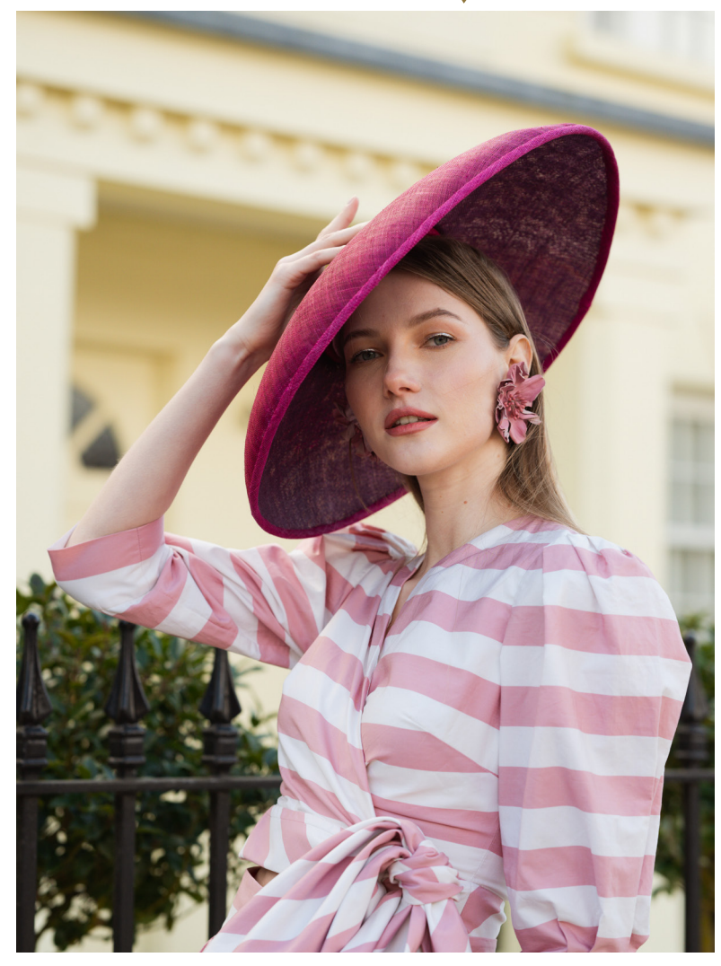
Inspired by the Ying & Yang symbol and the balance it represents. This headpiece is a beautiful oversized Dior downturn brim in silky Pinok Pok material, decorated with a complimentary a two-toned Sinamay crown.