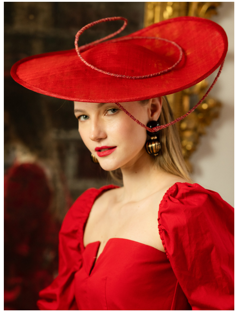
Inspired by a mathematical gradient. The Exponential headpiece is made from an oversized red Sinamay disc and decorated with cotton-covered wire swirls which run across the face and above the crown.