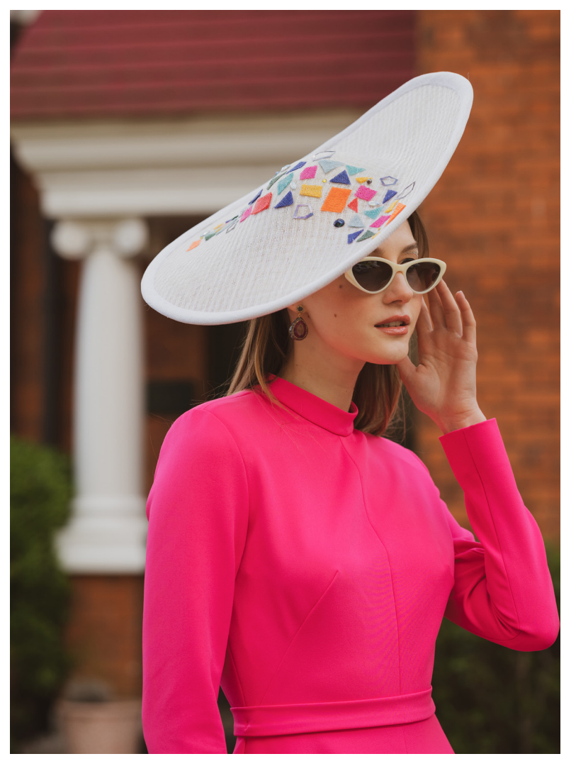
Inspired by mathematical angles and shapes. The acute headpiece is an oversized Sinamay disc decorated with multi-coloured geometric shapes, beads, and iridescent film.