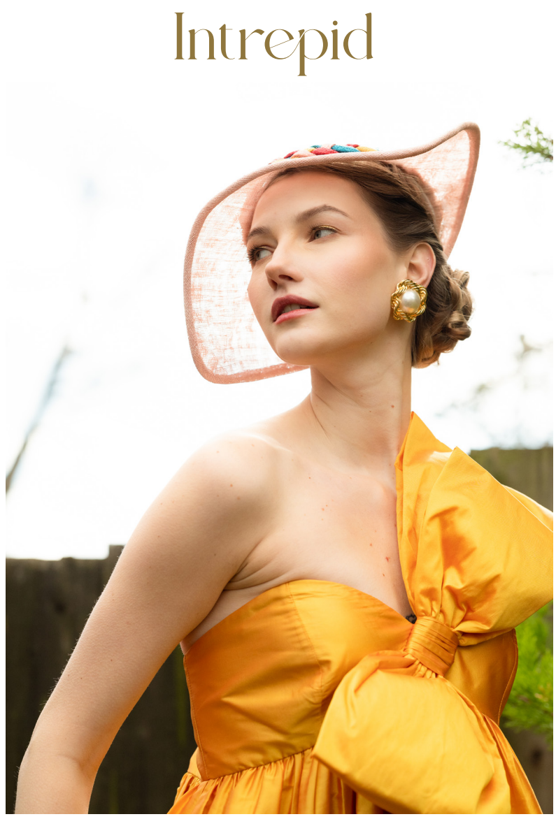
Inspired by the buoyancy force. The Intrepid headpiece is a hand-blocked nude-coloured asymmetric headpiece decorated with a multi-coloured straw plait woven around the crown.