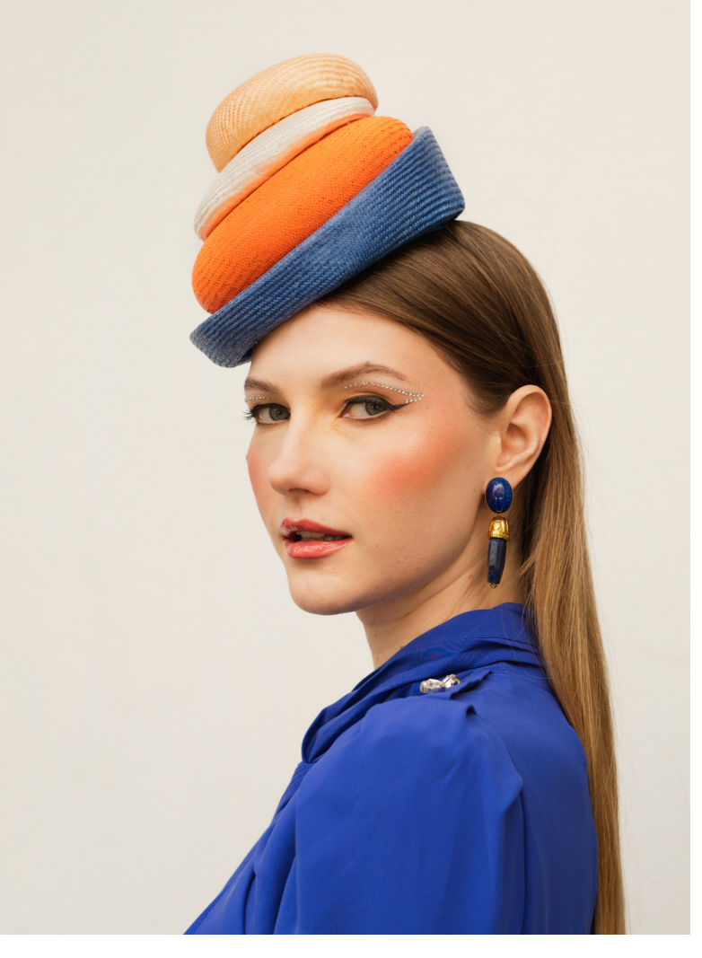
Inspired by the art of stacking uneven stones. The Stasis headpiece comprises of four Parasisal button headpieces, hand blocked in different sizes and colours, and hand sewn onto each other to create a colourful tower.