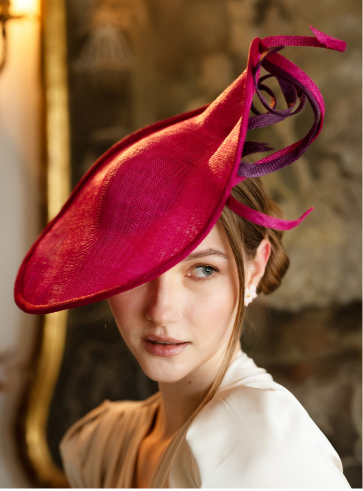
Inspired by a tipping balance, this vibrant fuchsia side sweep headpiece is made from luxurious Sinamay and embellished with two-toned Sinamay swirls that decorate the headpiece's right underside.