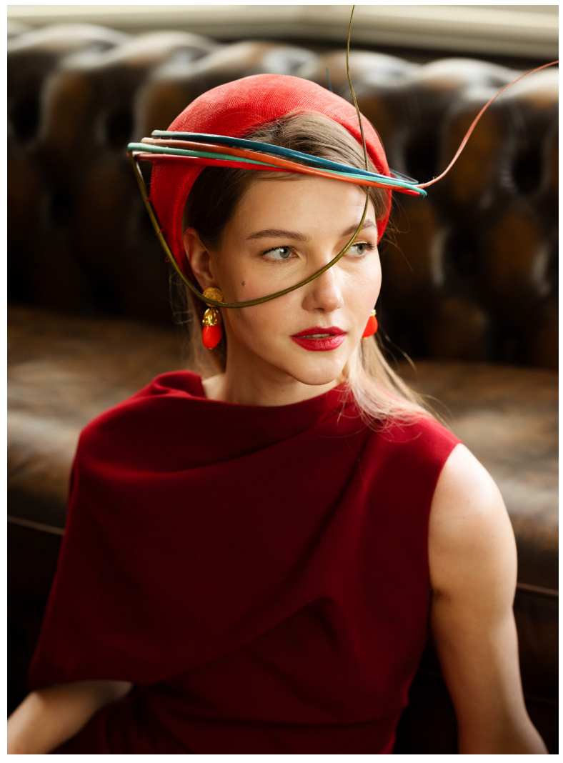
Inspired by the wind whooshing through branches forcing a tree to remain firm when swaying back and forth. The Ramify headpiece is made from a hand-blocked wide halo band and embellished with 5 different coloured quills which float across the face.